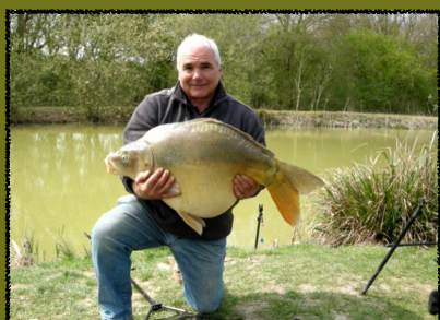
A stunning English thirty from the Specimen lake.