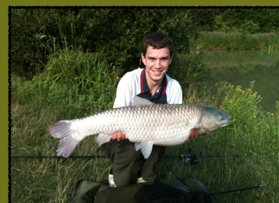
The specimen lake produced this twenty plus grass carp for this happy angler.